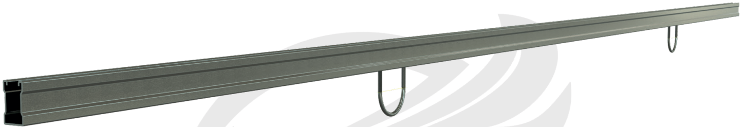
OPR NS PURLIN MAX x 2