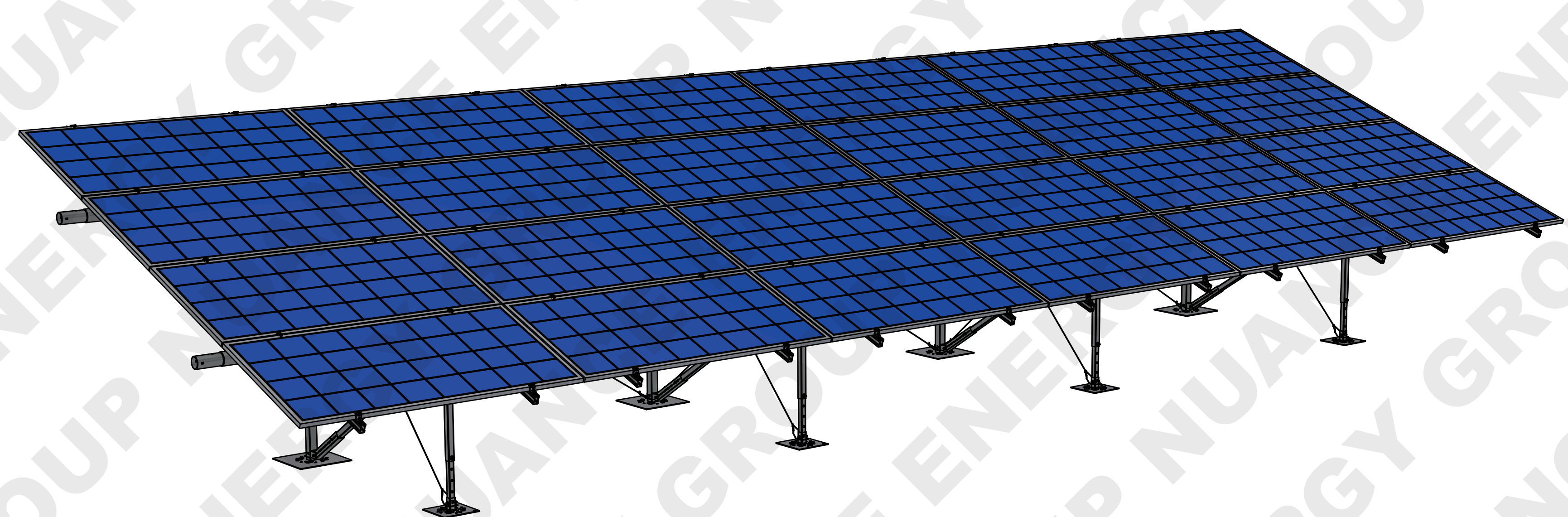
350-700W PANELS SCALE 1 / 20